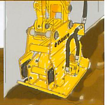
COMPACTION AROUND FOUNDATIONS